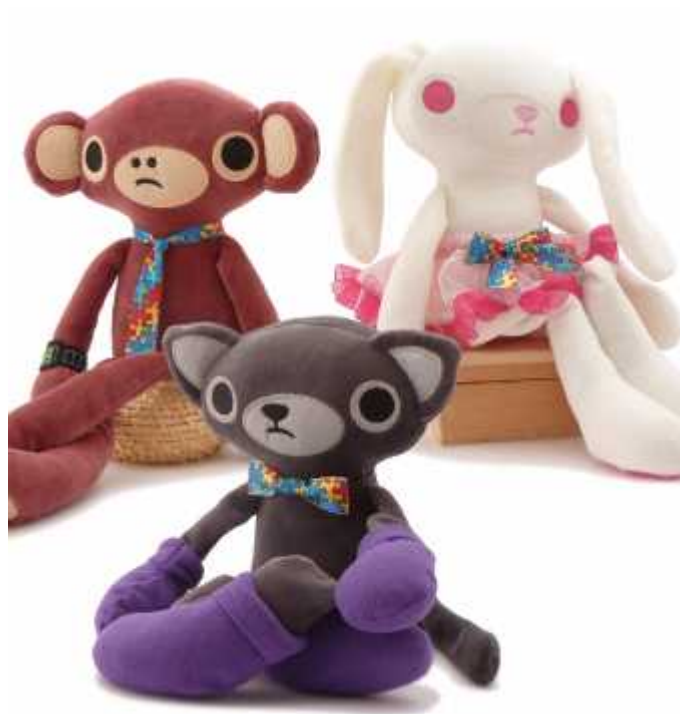
Lilikin the Melancholy Grey Kitten Mollycoddle the Ultra-Dainty Albino Bunny Eleven the Small-for-his-age Monkey

They are now on our website 18" Organic Cotton Plush Toy