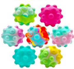
Stress Ball Pop Fidget Toy, 3D Silicone

We have new merchandise at our office that is not yet online as we are trying them out before we add them. on our website at www.cnaf.net/fundraisers.html